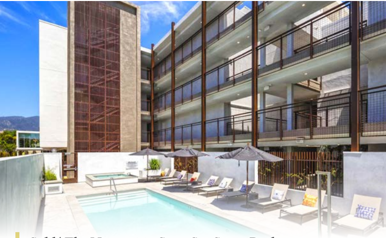
Sold | The Marc, 3885 State St., Santa Barbara 89 Units | $56.2MM (Off Market)

No doubt 2018 was a relatively slow year for multifamily investment sales in the South County. The effects of the twin natural disasters from last December and January certainly impacted all commercial real estate sectors at the beginning of the year. That coupled with the continued trend of low inventory, we tallied just 21 total sales of multifamily properties 5+ units in size during 2018, four fewer than 2017 and well below 2016's record 42 sales. Still, the year did end on a positive note with seven (7) sales of properties 5+ units in size during Q4. All said, the multifamily investment market throughout the Central Coast has held steady and looks to stay that way in 2019.